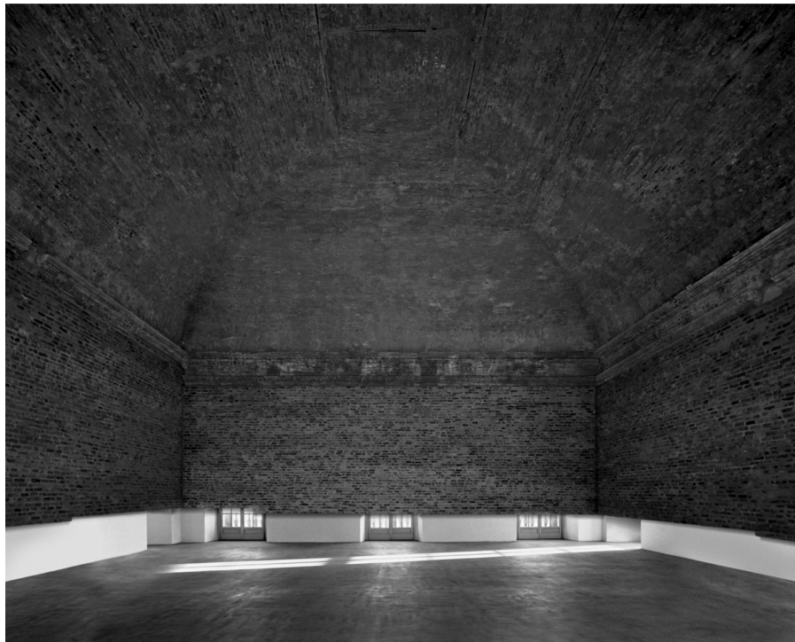
Doris Salcedo, Abyss , 2005

The immigrant is not only hemmed in by his appearance; he has been stripped of all humanity. A rejection of the immigrant’s status as human being, the fact his political refugee status, or even his status as a worker, has been erased makes manifest that he is an object of hate. The immigrant, exposed to brutal economic rationalities, and to the abject nature of post-industrial urban life, does not inhabit the first world. Levinas has changed “I think, therefore I am” to “I inhabit, therefore I am”. To inhabit is to exist. Levinas even goes further: to inhabit is to be in a place where one is welcome.